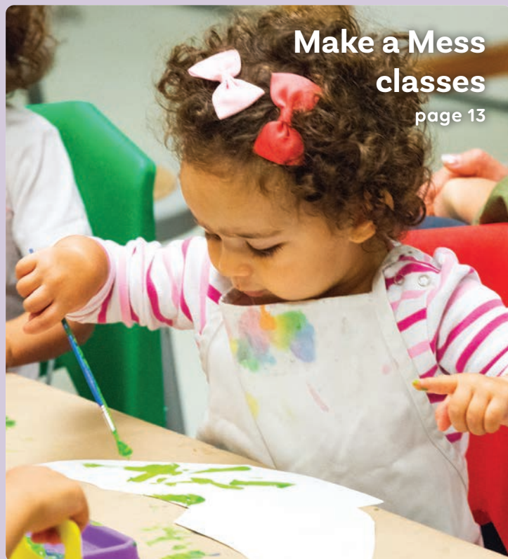
Make a Mess classes page 13