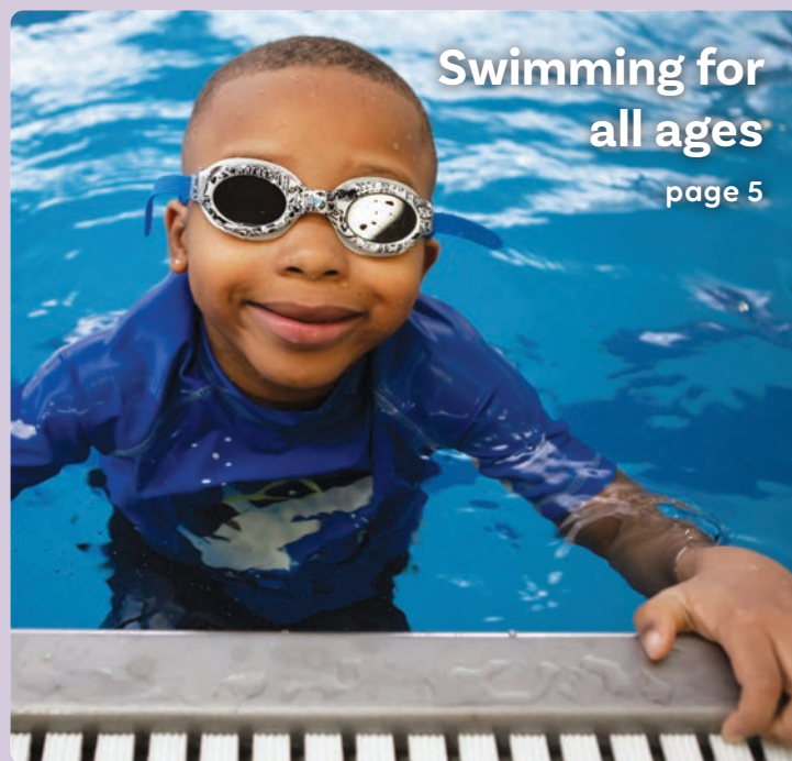
Swimming for all ages page 5

Visit manhattanyouth.org/membership and join today.